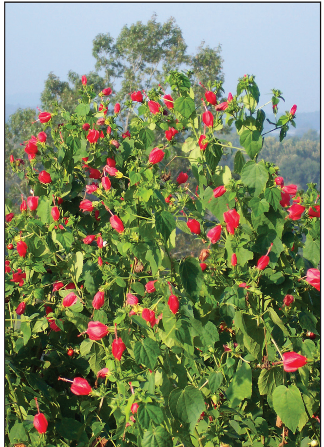
The low oil content of Malavaviscus "Big Momma" makes this plant less flammable.