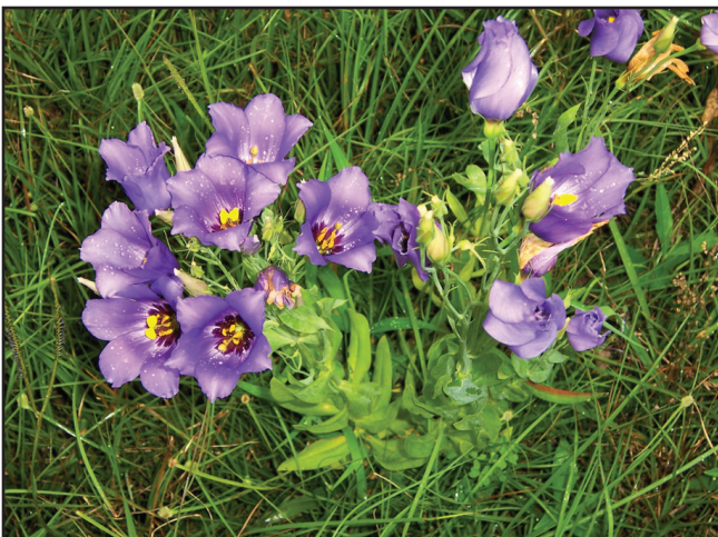
The high moisture content of the Texas bluebell makes it slower to ignite.