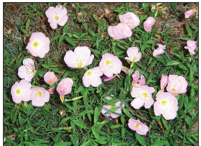
Mexican primrose, a low growing plant, helps maintain the vertical separation of fuels.