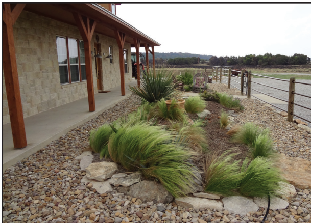
Native xeric landscaping allows water-wise practices to create a landscape that will flourish in hot and dry conditions.